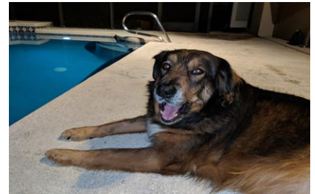
Oliver lounging by the pool